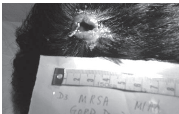
Figure 1. Post-operation day 3.

infection (Figure 1). He was educated on using JUC spray for wound care at home and the procedure was demonstrated once. Standardised, self-explanatory leaflets were given to enhance the patient's compliance and confidence. The patient was instructed to use JUC three times per day. Before each application, the patient cleaned the wound simply with ordinary soap or shampoo. Then the wound was dried with clean gauze. JUC was subsequently sprayed into the wound cavity. In general, one or two sprays were adequate but more sprays were necessary for larger abscess cavity initially. Spray nozzle and packing gauze were provided because of the presence of deep cavity and discharge. No other form of treatment including antibiotic was involved. Follow up on post-operative day nine and thirteen showed satisfactory wound healing, and repeat wound swab yielded no bacterial growth (Figures 2 and 3). He was satisfied with the convenience of wound care by himself, and he could manage to apply JUC on his scalp wound in front of the mirror.